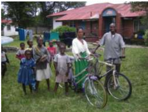
Hut to Hut Evangelism