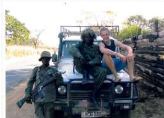
Road Block ministry