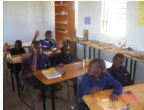
Eagles Wings School and Misaka