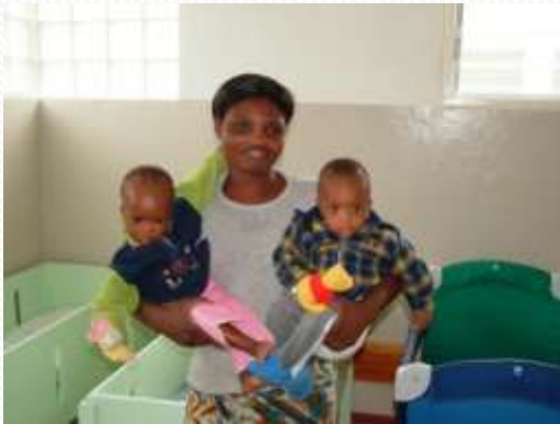
St Anthony – Children's Village